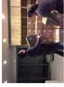
Japan to Liberia