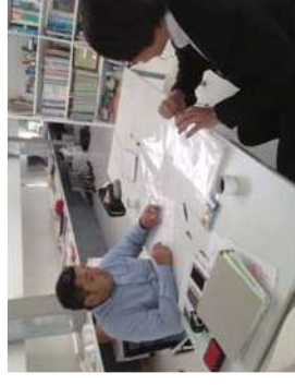
Meeting of production of transparent body bag