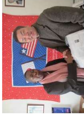
Delivering to Ambassador of Liberia in Japan

3 We designed a transparent body bag and improved to allow farewell without opening the bag containing the infected person. We received an official request from Ambassador Liberia in Japan and delivered for 800 bodies (1,600 bags) to Liberia.